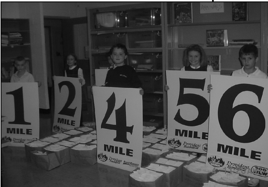
St. Vivian students stuffed 12,000 envelopes for the local Thanksgiving Day Race.