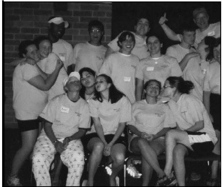
The Workcamp team worked hard and played hard