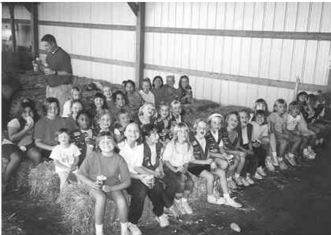
St. Vivian Third Grade Brownie Troop 336

Now a little bit about our troop. Most of our group have been together since kindergarten. Now, we have the entire third grade class in our troop (18 girls). We meet at least once a month and usually also have an outing or activity. We try to raise all our money by selling calendars, cookies or having bake sales.