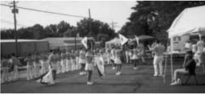
The Roger Bacon Band repeats their festival opening performance