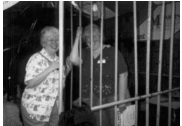
Jail N Bail had a lot of customers