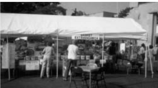
Basket Extraveganza – before the rains