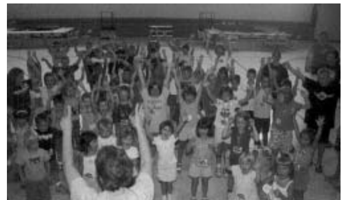
80 Children, 11 Adult Leaders, and 23 Youth Aides participated!

This year at VBS we had an incredible 23 young people volunteer as aides. Some of them were