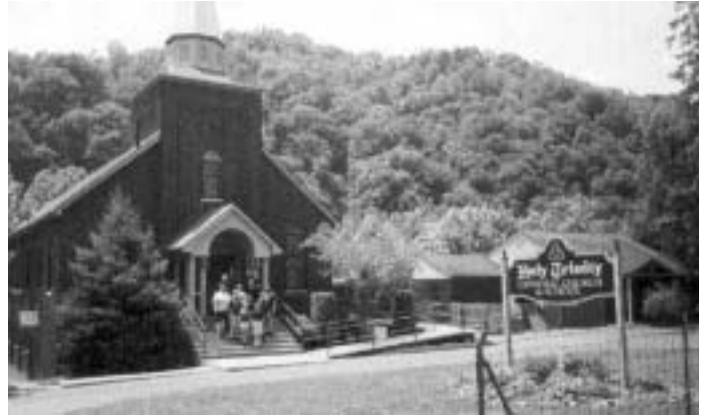
The "delivery team" poses on the steps at the Holy Trinity Church in Harlan County, KY.

The sisters who were present the day of delivery looked overwhelmed, as box after box was unloaded onto their porch. The porch filled up quickly, and the overflow boxes ended up in their living room, kitchen, and bedrooms. The textbooks donated by our school were taken directly into their school. The generosity of the people of St. Vivian and the surrounding community gave many families