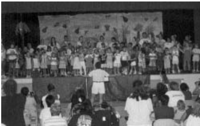
Vacation Bible School participants perform for the parents.