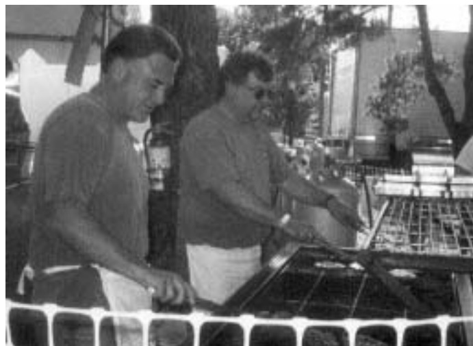
Grillers hard at work.