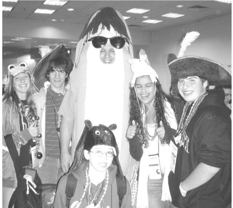
St. Vivian teens pose with their NCYC hats and a corny new friend.